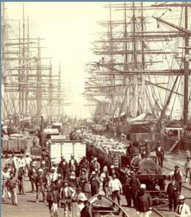
Melbourne docks 1850

Today the Swire Group spans four continents covering aviation, property, beverages, marine services and trading and industrial.